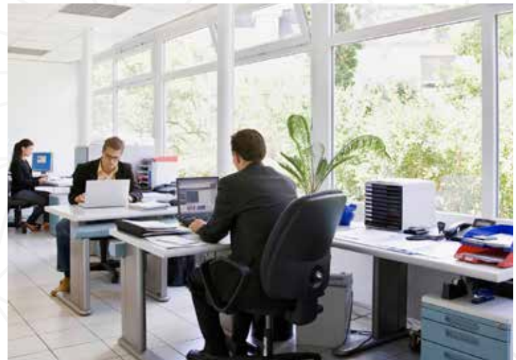
Manages Office Furniture and Equipment

During the past decade, RFID has come to be regarded universally as the standard by which all asset tracking and management systems are measured.