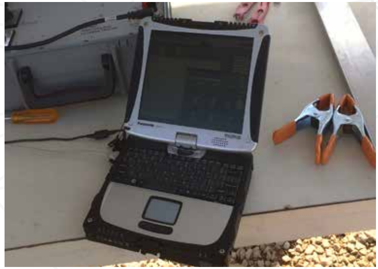
Asset Linked to Particular Individual