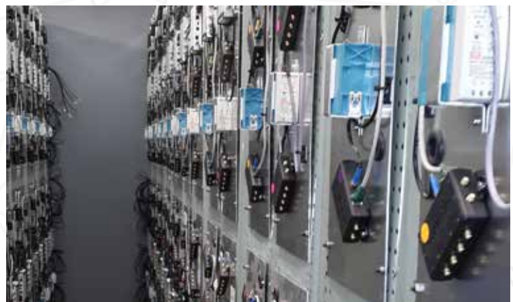
RFID Infrastructure for Retrofitting for Asset Management