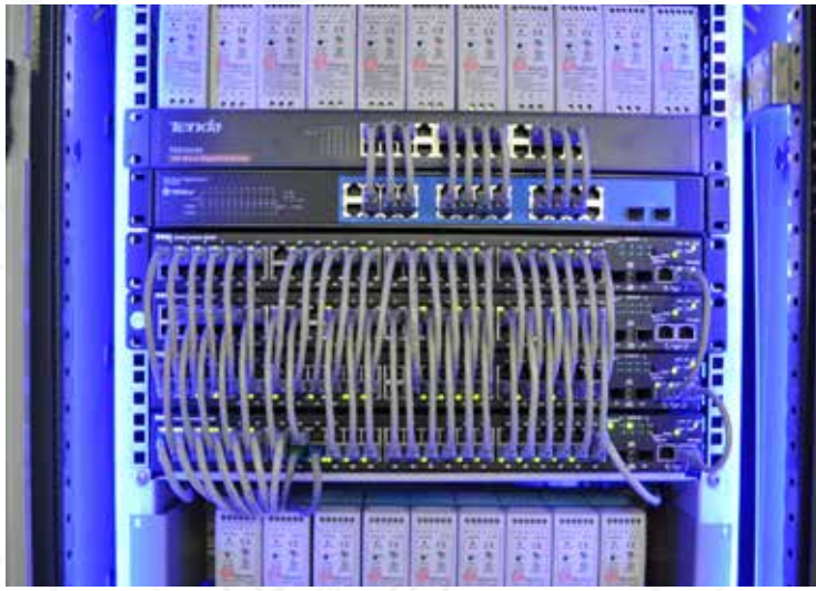
IT Infrastructure Monitoring and Management