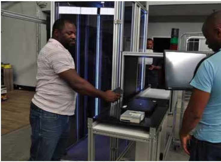
Seamless Asset Scanner